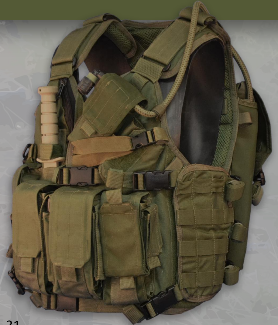
VL-31 Multi-Purpose Assault Vest