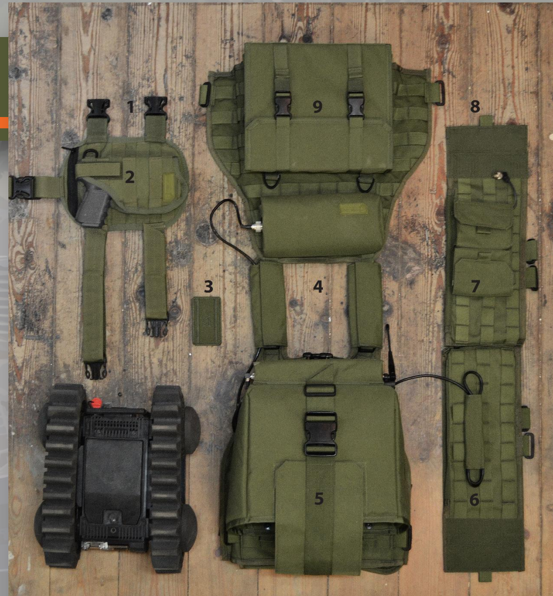
1. M.O.L.L.E Drop Leg Pouch 2. Tactical Handgun Holster -T9-W17 3. Israel Flag-tag